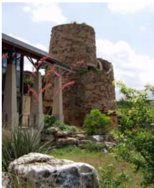
East view of tower, part of the rainwater collection system.

To address this problem, the Wildflower Center established an information clearinghouse. The Internet-based Native Plant Information Network (NPIN) is the largest clearinghouse of native plant information in North America. Since its inception in September 2003, more than 73,000 individuals have used the network to find plant images, information about plant species of North America, and regional information about landscapers and plant suppliers, and a calendar of events related to native plants. NPIN is a free service that is useful to home gardeners as well as professional land managers and plant scientists. An "Ask the Expert" feature allows anyone to get answers and advice from Center staff.