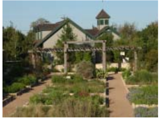
Display gardens, McDermott Learning Center and butterfly habitat gardens.

The gardens showcase the beauty and benefits of the wildflowers and native plants of Texas, particularly of the Texas Hill Country. They introduce people to native plants and demonstrate how they