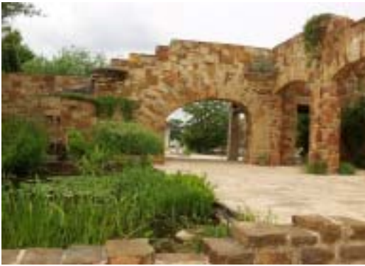
Entry arches.

"My special cause...is to preserve the wildflowers and native plants that define the regions of our land – to encourage and promote their use. Native plants are as much a part of our national heritage as Old Faithful or the Capitol Building in Washington, and they speak the regional accents of the land, saying this is Virginia, or New Mexico, or the California desert after rain." Lady Bird Johnson, 1990.