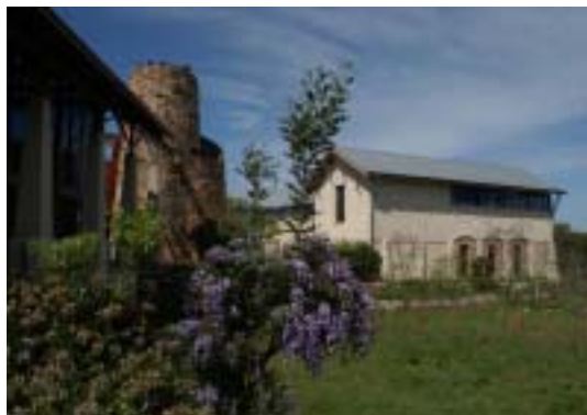
Tower and library with Texas Mountain Laurel ( Sophora secundiflora) in the foreground.