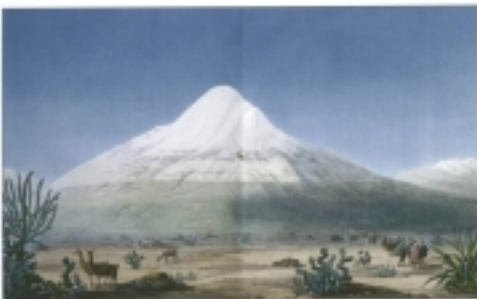
From Vue de Cordillera, et noumen des peuples indigènes de l'Amérique , 1820, by Alexander von Humboldt. A plate showing plant collecting at the base of the volcano Chimborazo, Ecuador.