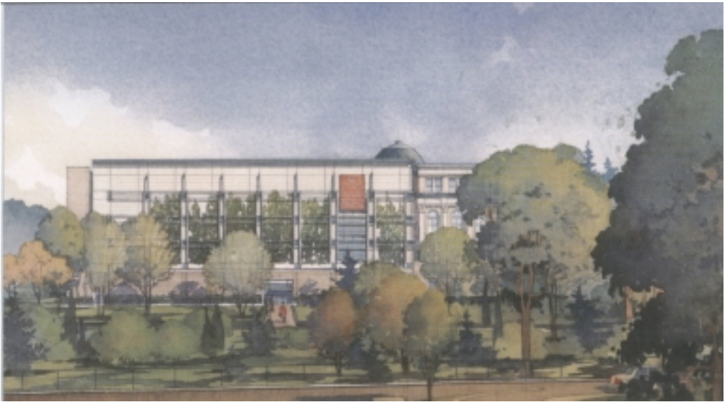
New Herbarium Building

Structure section is the frontispiece from Giovanni Battista Falda's Li giardini di Roma (1683). Among the five works highlighting American Native Trees is the illustration of Sequoia wellingtonia "The Two Guardsmen" from Edward Ravenscroft's The Pinetum Britannicum , 1884. "The Fruit of the Cashew" is one of three lithographic plates from