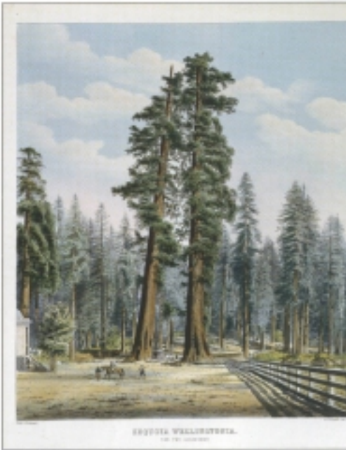
From The Pinetum Britannicum , 1884, by Edward Ravenscroft. A plate of Sequoia wellingtonia "The Two Guardsmen."