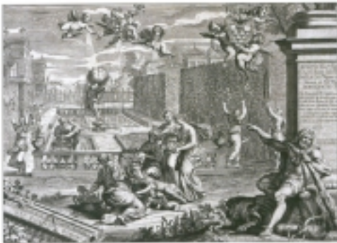
From Le jardins de Rome ..., 1683, by Giovanni Battista Falda. The fountains depicts a view of the mythical garden of the Hesperides.