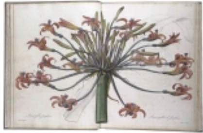
From Les Oiseaux , 1822-1826. Plate Joseph Redouté's "Anary-Elis Josephine."