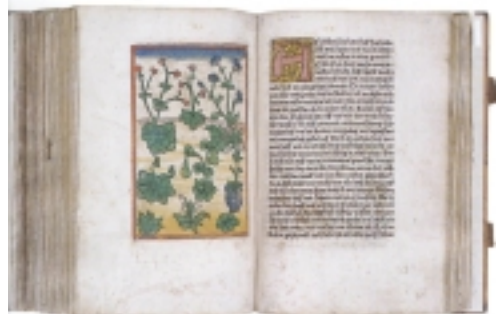
From Das buch der natur ..., 1475, by Konrad von Megenberg. The earliest known printed plate of a plant illustrating text.